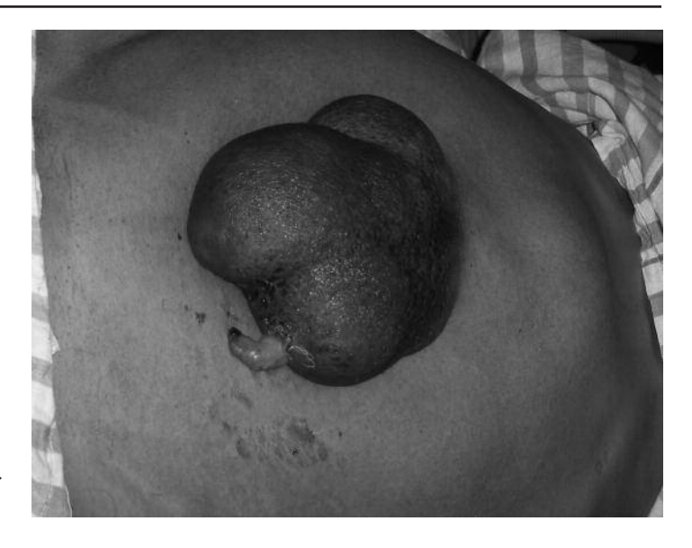
Figure 1. Evisceration of appendix through large umbilical hernia.

1. Amyand C. Of an inguinal rupture, with a pin in the appendix coeci, incrusted with stone; and some observations on wounds in the guts. Phil Trans Royal Soc. 1736;39:329.