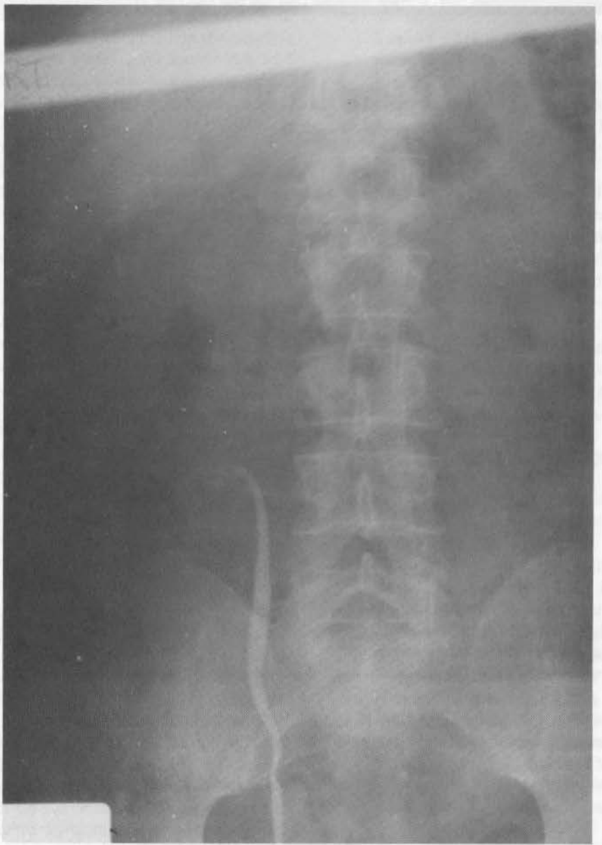
Figure 1 Retrograde pyelogram showing obstruction of the right ureter.