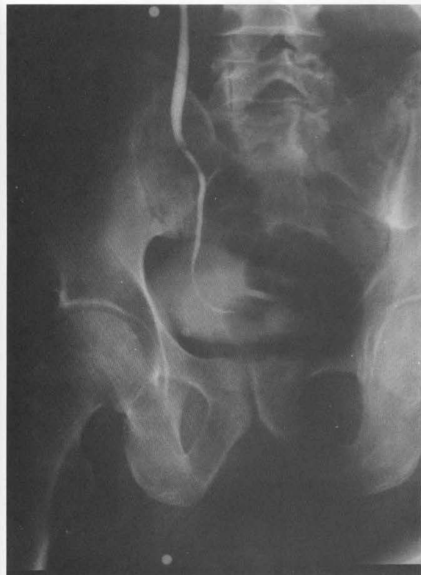
Figure 2 Antegrade pyelo-ureterogram showing a ureteral filling defect.