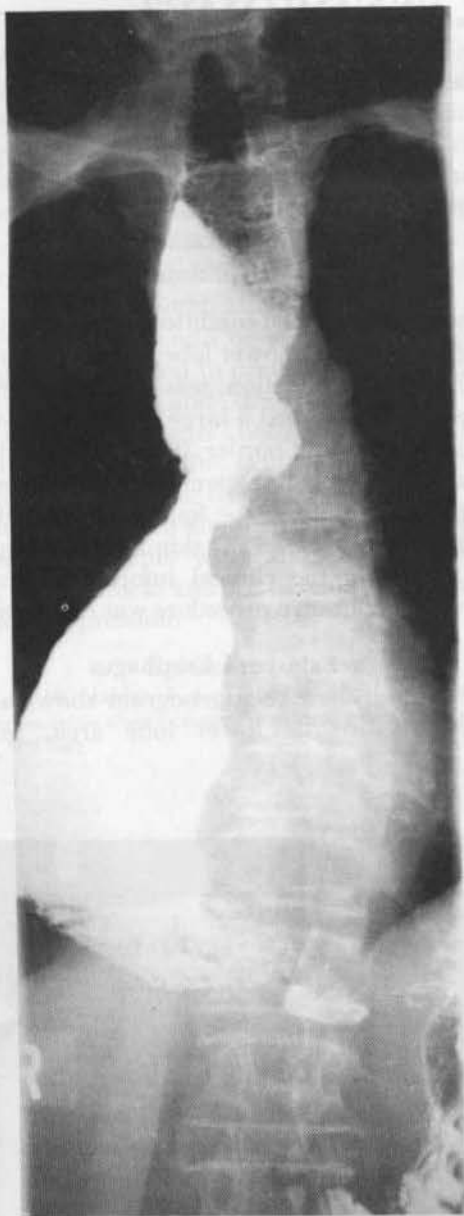
Fig. 2 Barium swallow showing dilated esophagus

displacement of the trachea and an air-fluid level in the upper esophagus (Fig. 1-B). A barium swallow showed no peristaltic activity below the thoracic inlet. The esophagus was markedly dilated and was right of mid-line in the middle and lower portion with distal narrowing (Fig. 2). The patient admitted to having difficulty swallowing solid food for many years. Esophagoscopy and CT scan showed