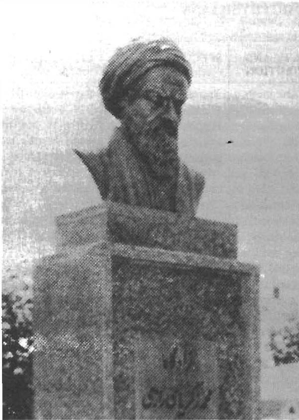
Figure 2 — Al-Razi (Razes) 841-926 A.D. (After Profile of Iran 2536 — May 1977, Vol. 11 No. 5.

Mansoris) which he dedicated to his patron Prince Al-Mansur. It was composed of ten treatises and included all aspects of health and disease. He defined medicine as "the art concerned in preserving healthy bodies, in combating disease, and in restoring health to the sick." He thus showed the three aspects of medicine namely, public health, preventive medicine, and treatment of specific diseases. He listed seven principles for the preservation of health: