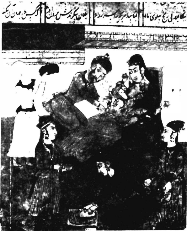
Figure 8 — Cesarean Section as described by Al-Firdawsi (1010 A.D.) (After Speert H: Iconographia Gynaetrica and Obstetrics . Philadelphia T.A. Davis Co. 1973).

umbilical cord. The veins pass food for the nourishment of the fetus, while the arteries transmit air. By the end of seven months, all organs are complete. . . . After delivery, the baby's umbilical cord is cut at a distance of four fingers breadth from the body, and is tied with fine, soft woolen twine. The area of the cut is covered with a filament moistened in olive oil over which a styptic to prevent bleeding is sprinkled. . . . After delivery, the baby is nursed by his mother whose milk is the best. Then the midwife puts the baby to sleep in a darkened quiet room. . . . Nursing the baby is performed two to three times daily. Before nursing, the mother's breast should be squeezed out two or three times to get rid of the milk near the nipple." These findings of Ibn-Al-Quff, appear basic and fundamental, but seven hundred years ago, they were new and different.