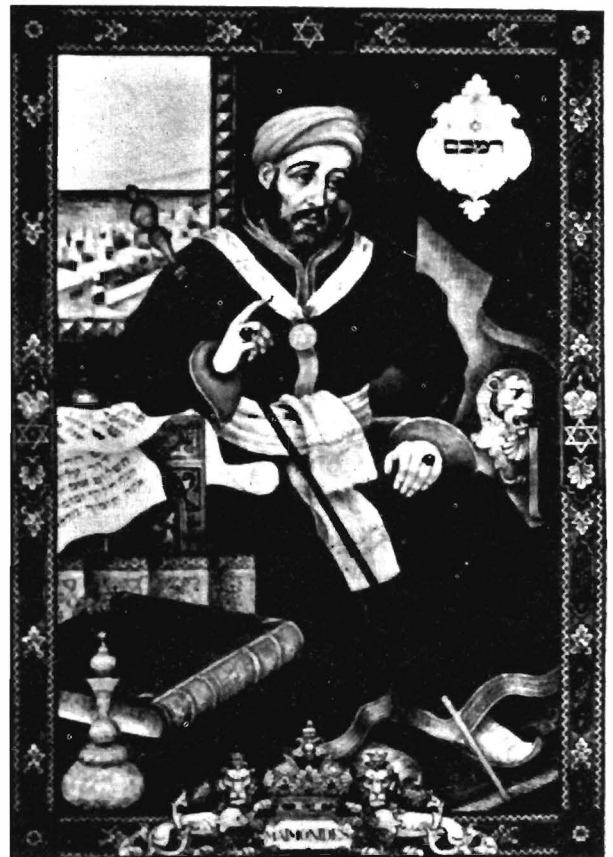
Figure 6 — Ibn-Maimon (Maimonides) 1135-1204 A.D. (After Black M, Roth, C: Maimonides. Merit Students Encyclopedia Vol. 11, 409, Crowell-Collier Educational Co. 1970).

In 1135, Musa Ibn-Maimon (Moses Maimonides) was born in Cordova, Spain (Fig. 6) (Minkin 1968). His father was a rabbi and had a great influence on