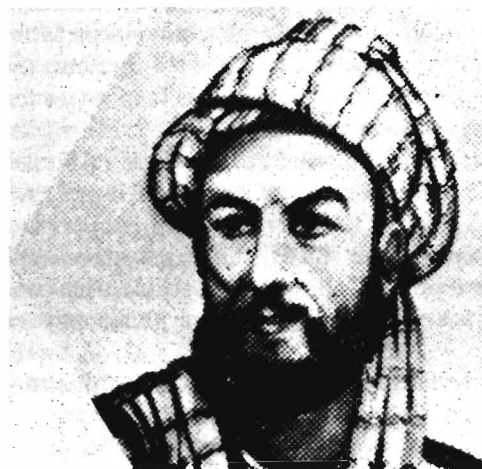
Figure 7 — Ibn-El-Nafis 1208-1288 A.D. (After Ibrahim, S.: Lights on History of Sciences: Ibn-El-Nafis. Hospital Medical Practice Cairo 1:35-39, 1971).

In 1208 A.D., Ala' El-Deen Ibn-El-Nafis was born in a small town near Damascus called Kersh (Fig. 7)