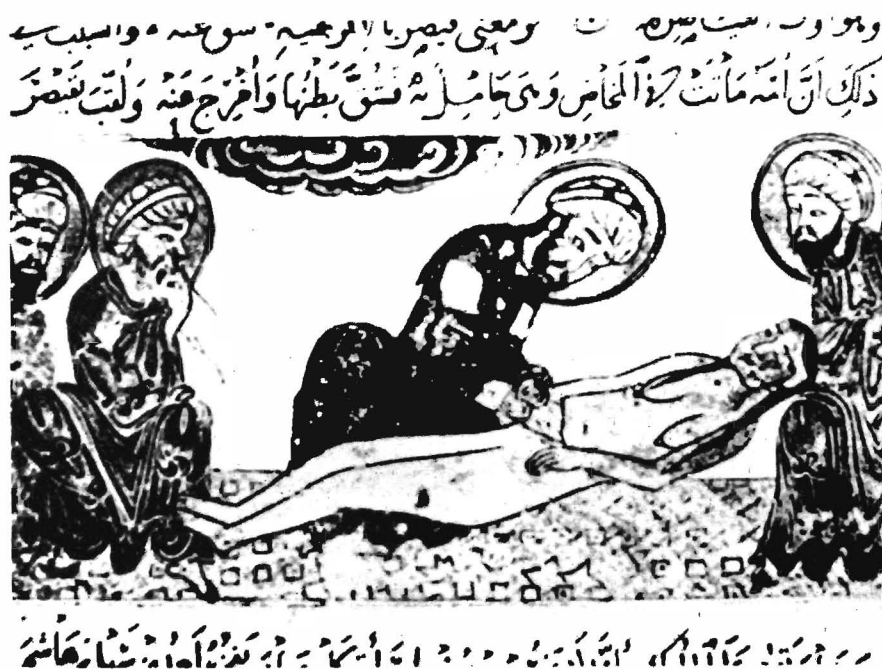
Figure 9 — Cesarean Section as described by Al-Biruni (1307). (After Speert, H.: Iconographia Gynaetrica and Obstetrics . Philadelphia: T.A. Davis Co. 1973).

One cannot help but look with admiration upon the way the Muslims handled their responsibility towards mankind. They not only preserved, but also added to earlier achievements in medicine. They have fostered the flame of civilization, made it brighter, and handed it over to Europe in the best possible condition. Europe, in turn, passed it to the United States of America, and the cycle continues.