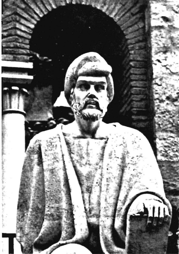
Figure 5 — Ibn-Rushd 1126-1198 A.D. (After Eigeland T: Islam in Al-Andalus, Aramco World Magazine 27/5, Sept. Oct., 1976).

Ibn-Rushd, or Averroes as known in Europe, was born in Granada in 1126 A.D. (Fig. 5). He studied