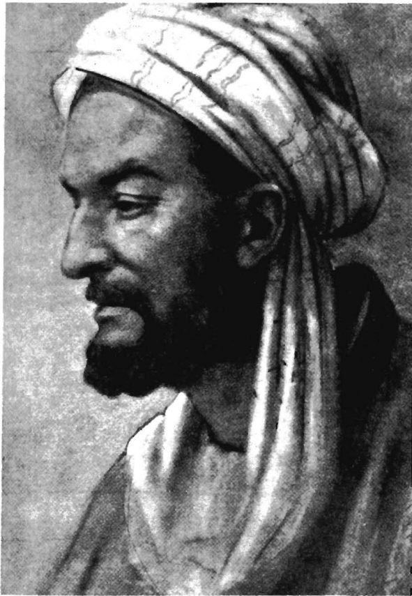
Figure 4 — Ibn-Sina (Avicenna) 980-1037 A.D. (After Profile of Iran 2536 — May 1977 Vol. 11 No. 5.

law studies, geometry, anatomy, logic and philosophy. His metaphysics were influenced by an earlier philosopher in Islam, Al-Farabi. By the age of 18, he completed the study of medicine. Soon after, he became the Prime Minister (the Visier) and Court-Physician of Prince Nuh-Ibn-Mansur, the Samanid Ruler of Bukhara. The prince was impressed by the intelligence and endurance of his Visier and opened for him the royal library which was unique in its literary richness. Ibn-Sina wrote his first book at the age of 21. Then he became Visier of Ali ibn Maimun, the ruler of Khawarazm or Khiva. But he ultimately fled to avoid being kidnapped by the Sultan Mohammed El-Ghazin. Ironically, fate played an important role in the life of Avicenna who was a master in planning. The ruler of Hamadan, the southern part of Persia, who was called Amir Shamsu'd-Dawla, had renal colic. Ibn-Sina treated the Amir's colic. The latter was very pleased and appointed Ibn-Sina, not only his Court-Physician but also his Visier. Avicenna was a proud and arrogant man. This created enemies leading to a mutiny of the military leaders against him resulting in his dismissal and imprisonment. Fortunately, the Amir got renal colic once more and no one could