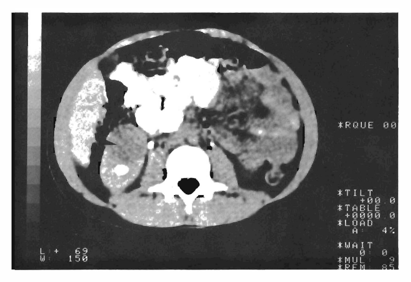
Figure 2. Transverse CT scan shows a hypodense, hypovascular, well-defined mass in the lower pole of the right kidney (black arrow). There is no extension outside the renal capsule.