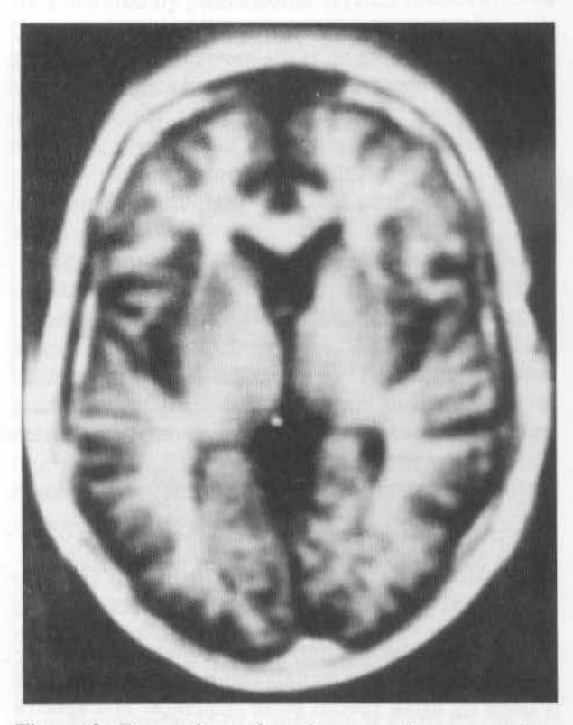
Figure 2. Precession of nuclear angular momentum (L) of proton about the direction of static magnetic field ( H_0 ).