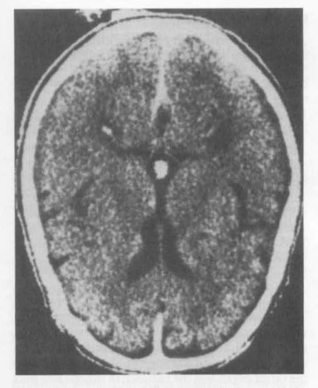
Figure 1. X-ray computed tomography image of the normal human brain, providing visual evidence of size, shape, position and symmetry of the fluid filled ventricles.

"Tomograph" is derived from the Greek "tomos", meaning "to slice", and "graph" meaning "picture". Thus a tomograph is a pictorial representation of a slice taken from a body. The x-ray beam in computed tomography (CT) is collimated into a thin (1.5 to 10 mm) fan that lies in a plane perpendicular to the long axis of the body. A circular array of detectors enclose the patient. The