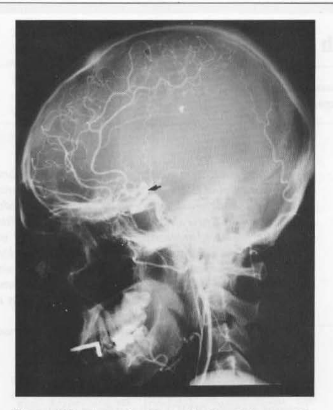
Figure 2B. Lateral view of the left carotid arteriogram shows a metallic pellet (arrow) in the left middle cerebral artery. There is no opacification of the distal branches of MCA, but good filling of the left anterior cerebral artery. (A delayed film showed retrograde filling of the distal branches of the MCA).

Kapp JP, Gielchinsky I, Jelsma R: Metallic fragment embolization to the cerebral circulation. J Trauma 1973;13:256-261.