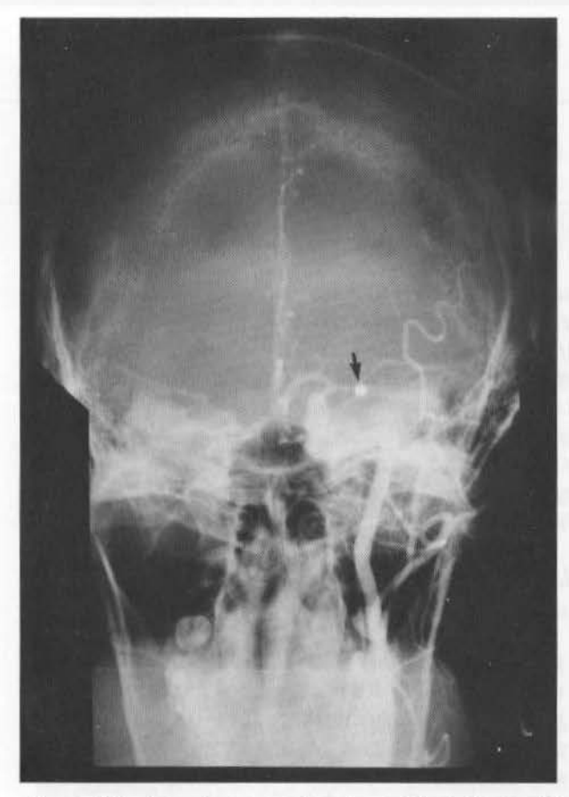
Figure 2A. Anterior-posterior view of the left carotid arteriogram shows a metallic pellet lodged in the trifurcation of the left middle cerebral artery. There is cutoff of the blood supply distally due to complete block (arrow).

consistent difference in the prognosis for the patients with neurological deficit with and without foreign body embolectomy. Those cases which were operated upon show restoration of the distal blood flow through the anterior communicating artery and antigrade flow of blood beyond the point of occlusion. This may prevent ischemia in the marginal ischemic areas thus avoiding further extension of the infarction.