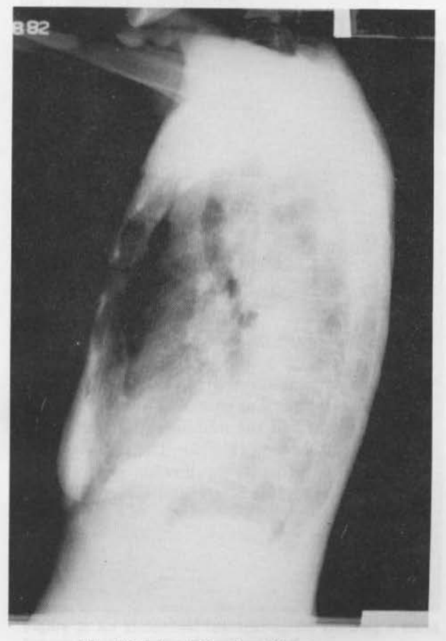
Fig. 1-B Lateral Chest roentgenogram