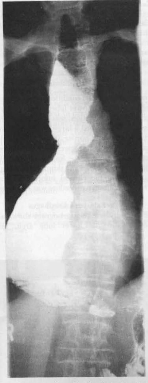
Fig. 2 Barium swallow showing dilated esophagus

displacement of the trachea and an air-fluid level in the upper esophagus (Fig. 1-B). A barium swallow showed no peristaltic activity below the thoracic inlet. The esophagus was markedly dilated and was right of mid-line in the middle and lower portion with distal narrowing (Fig. 2). The patient admitted to having difficulty swallowing solid food for many years. Esophagoscopy and CT scan showed