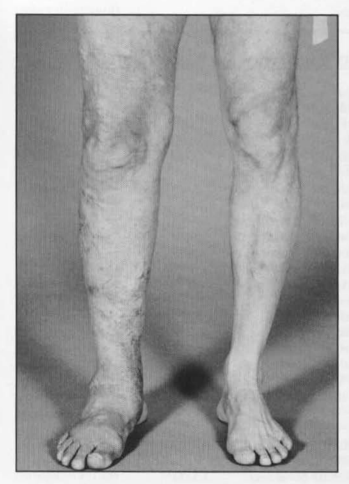
Figure 1. A port wine-colored stain is evident over the forefoot (A) and buttocks (B).

though there was no appreciable weakness, both the Achilles and the patellar reflexes were markedly diminished on the right side. The patient did have decreased pinprick in the L2, L3, and L4 dermatomes. The sensation of the sacral dermatomes was preserved.