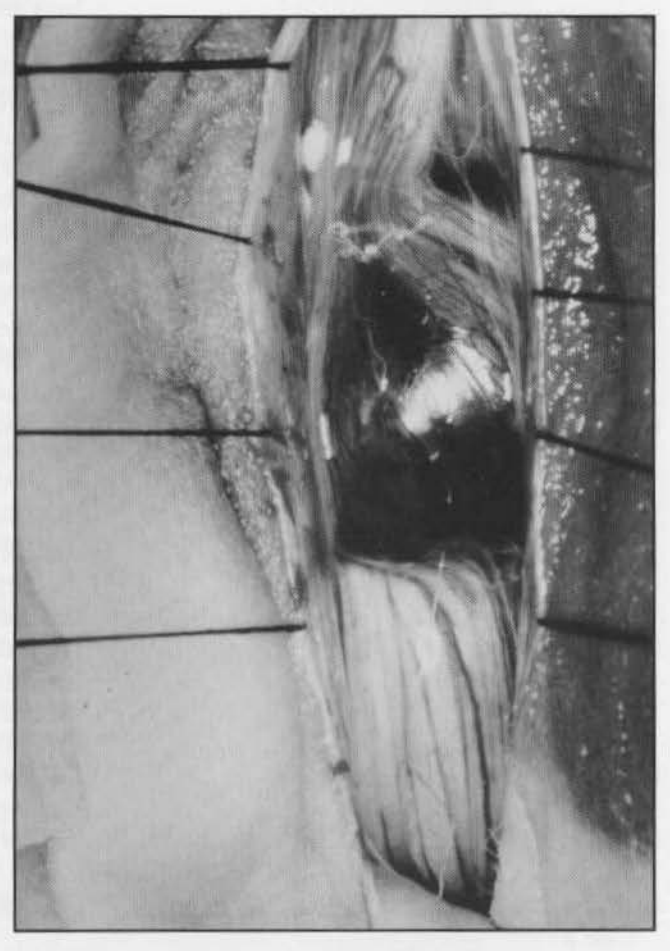
Figure 2. An intraoperative view of the spinal vascular malformation.